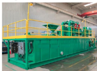
Mud Recycling System